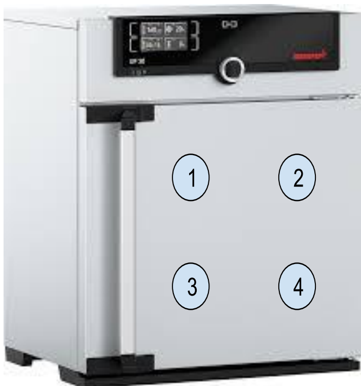
Diagrama de Posición de Sensores (Sensor Position Diagram)